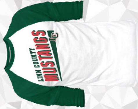
10 FOREST/WHITE RAGLAN $21