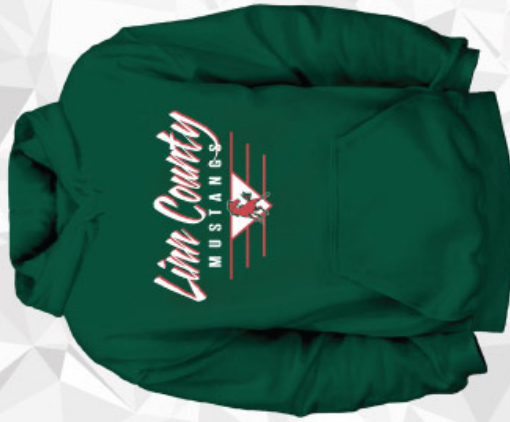
4 FOREST GREEN HOODIE $27