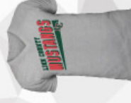
12 V-NECK SPORTS GREY • S-2XL • $21