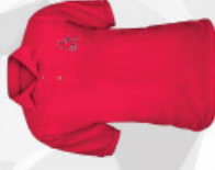
9 PIQUE POLO RED • S-3XL • $23