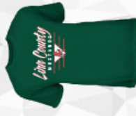
5 SHORT SLEEVE SHIRT FOREST GREEN • S-3XL • $16