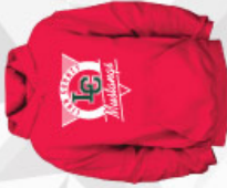
2 HOODIE RED • S-3XL • $27