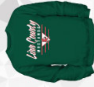
6 SWEATSHIRT FOREST GREEN • S-3XL • $24