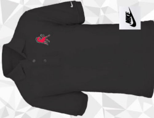
7 BLACK NIKE POLO $39