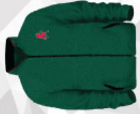
8 FULL-ZIP FLEECE JACKET FOREST GREEN • S-3XL • $37