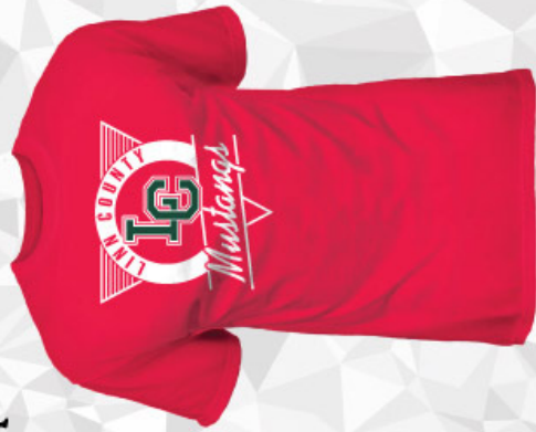
1 RED SHORT SLEEVE SHIRT $15