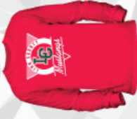
3 LONG SLEEVE SHIRT RED • S-3XL • $18