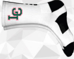
13 PERFORMANCE SOCKS $15